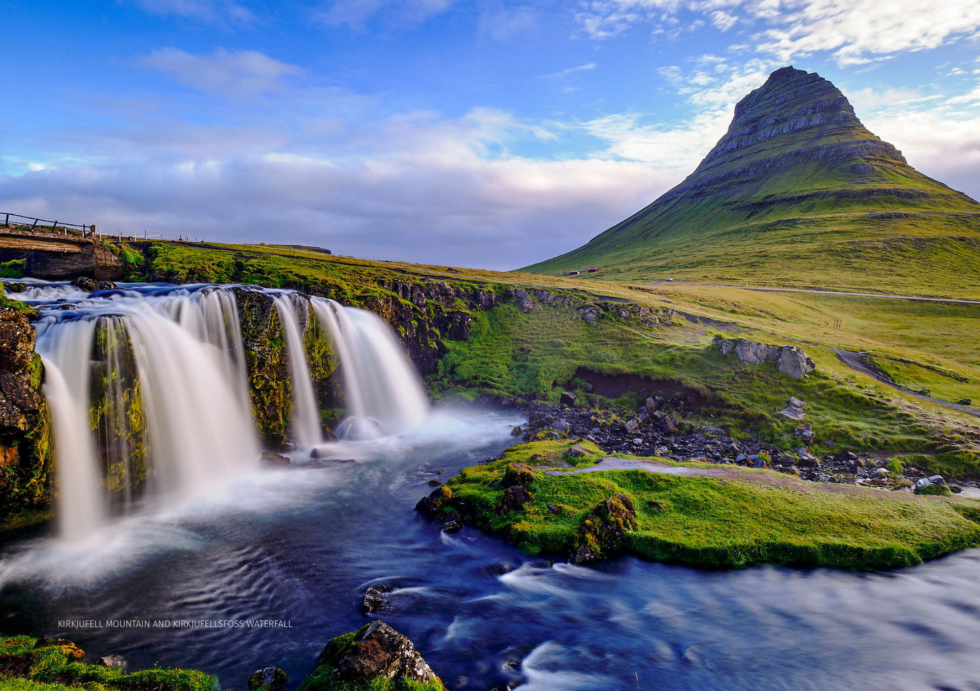
KIRKJUFELL MOUNTAIN AND KIRKJUFELLSFOSS WATERFALL